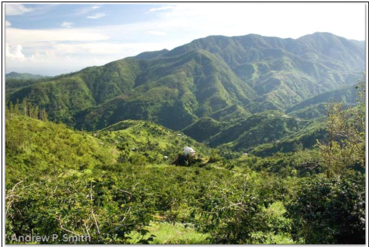
A view of the upper Buff Bay Valley on a hiking trail from Holywell to Cascade