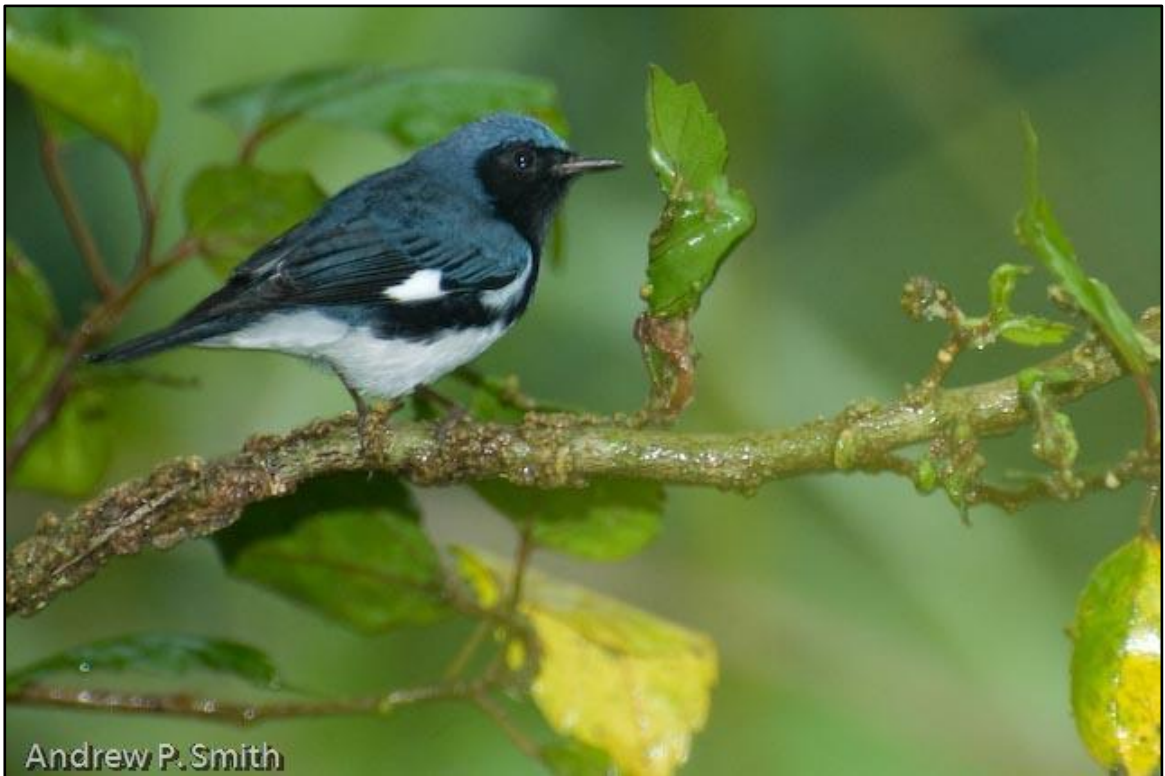
A male Black Throated Blue Warbler, photographed on the grounds of River Breeze cottage