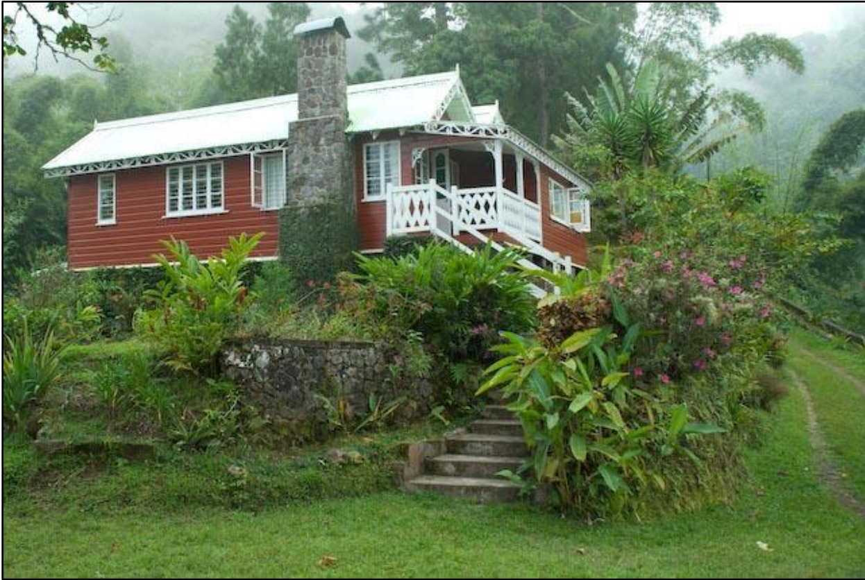
River Breeze Cottage. Cascade, Portland

River Breeze Cottage is a unique retreat located in Jamaica's verdant Buff Bay Valley where photographers can immerse themselves in their craft via workshops designed and presented by photographer and educator, Andrew P. Smith.