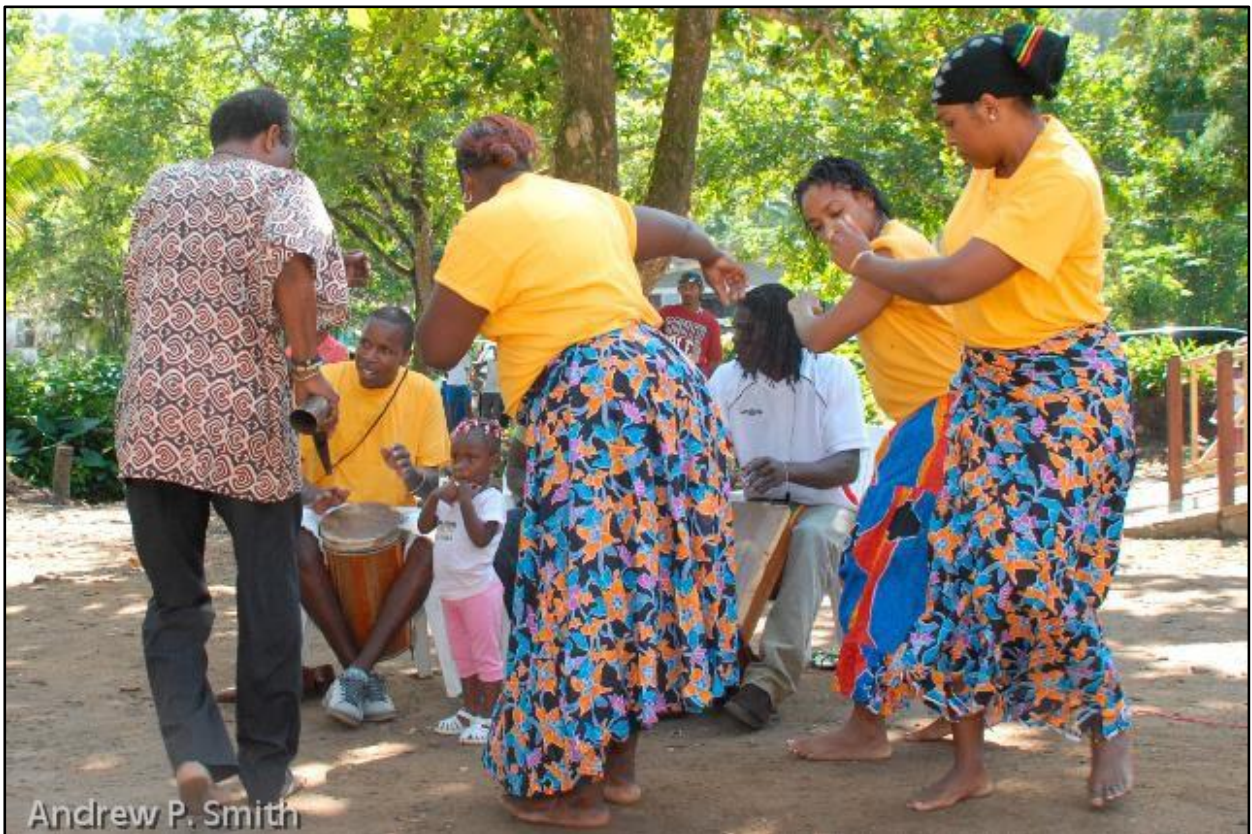
The Charles Town Maroons of the lower Buff Bay Valley