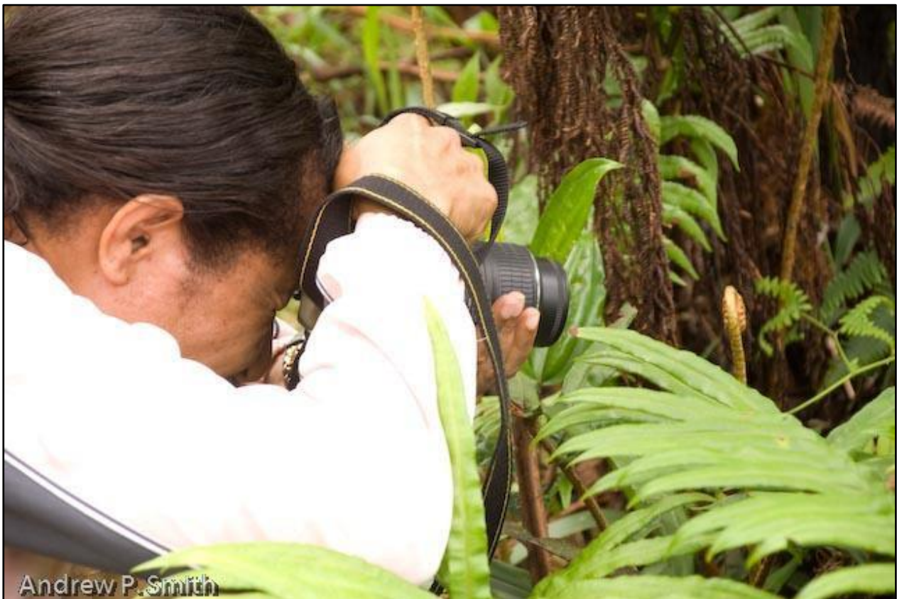
A workshop participant at Holywell Park in the environs of River Breeze cottage